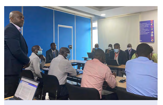
Launch of the training workshop on the development and validation of Terms of Reference (ToR) and Needs Assessments (NC), Kinshasa, March 2022.

Infectious disease burden in DRC is extremely high. In 2022 alone, the country faced several ongoing and concurrent outbreaks including Ebola, cholera, measles, monkeypox, bubonic plague, yellow fever, vaccine-derived polio, typhoid fever and malaria. Additionally, ongoing protracted crises and conflicts have exacerbated vulnerability to disease. According to the latest assessment of DRC's preparedness capacity (JEE 2018), the country is not well-prepared to prevent, detect and respond to epidemics.